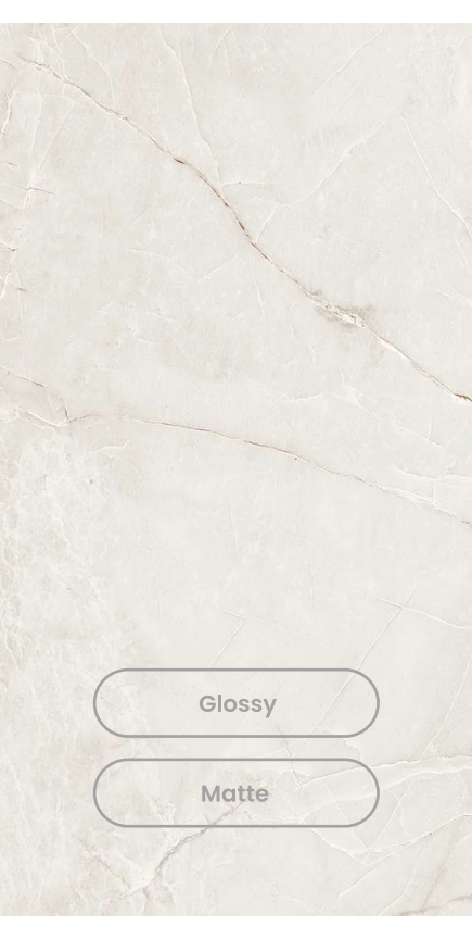
Sahara Pulido – CODE: L-10